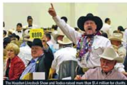
The Houston Livestock Show and Rodeo raised more than $1.4 million for charity.

posted a relatively small gain in 2012 for a total of $11,880,000. Once again, Naples garnered the two largest live-auction bids: A private concert for 100 people with LeAnn Rimes, accompanied by a wine dinner prepared by chef Tom Colicchio, sold for $1.1 million, while a collection of eight rare bottles of Chateau Haut-Brion, plus six bottles each of the 2010 Haut-Brion Blanc and Haut-Brion Rouge, sold twice at $550,000.