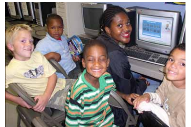
Children at Youth Village Summer Camp

This award will sponsor a Guest Suite at the Fisher House to unite families during recovery and continue to support the Children's Fund, which provides for the children of families staying at the Fisher House. The House provides a safe haven for families while their hero is healing.